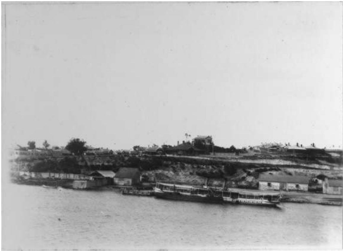
The Swan River at East Fremantle, date unknown but possibly the 1890s

Patron: Dr Brad Pettitt, Mayor of Fremantle