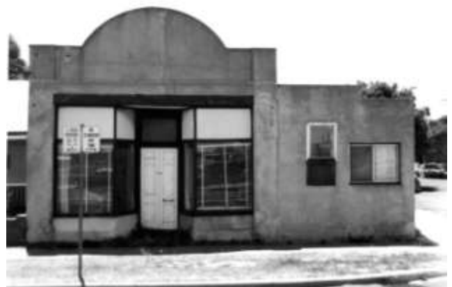
94 Marine Terrace