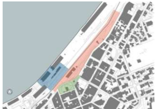
The three precincts being considered as part of planning for Victoria Quay, the Fremantle Train Station and Pioneer Park.

There will also be community presentation and open days in December and January.