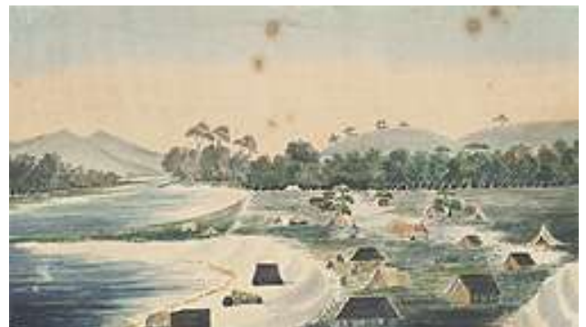
Fremantle's South Bay (now the Esplanade), painted from where Marine Terrace and Collie Street now intersect. (Christie's)

The purchase was assisted by funds from the State Library Foundation and from the Commonwealth's National Cultural Heritage Fund.